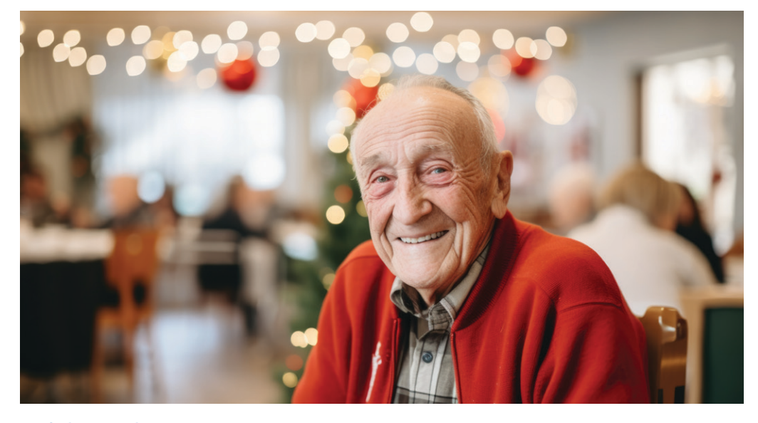
Holiday Gatherings (continued from page 1)

Community-based and non-profit, Hope Hospice is accredited by The Joint Commission, certified by Medicare and Medi-Cal, and is a member of the National Hospice and Palliative Care Organization and National Partnership for Hospice Innovation.