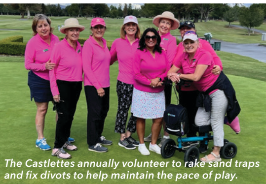
The Castlettes annually volunteer to rake sand traps and fix divots to help maintain the pace of play.